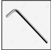
5mm Allen Wrench