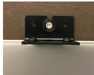
SCREEN SLID IN

"OUT" position provides opening to route cables from table top to undersurface