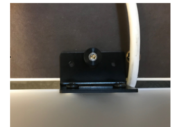
SCREEN SLID OUT

"OUT" position provides opening to route cables from table top to undersurface