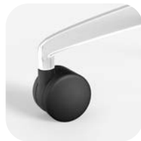
black nylon hard wheel