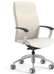
R5 back style executive swivel tilt Aluminum C arm w/ arm cap