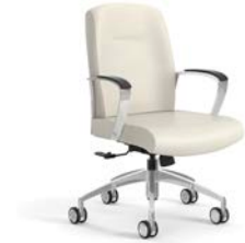
garvey back style management swivel tilt aluminum loop arm w/PU pad