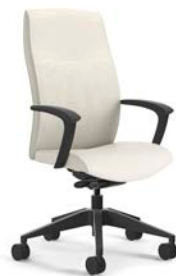
R5 back style executive swivel tilt (management swivel tilt not shown) Polyurethane C arm