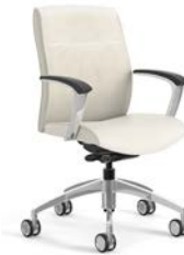
R5 back style management swivel tilt Aluminum C arm w/ arm cap