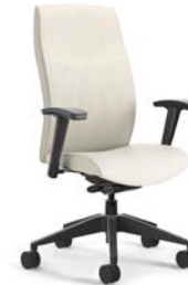
R5 back style executive swivel tilt adjustable T arm