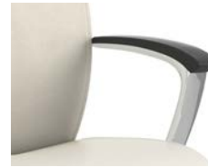
aluminum C-arm w/ polyurethane arm cap