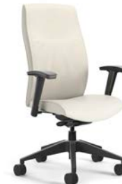
R5 model synchro w/ seat slider // swivel tilt adjustable back