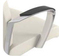
aluminum loop w/ polyurethane arm cap