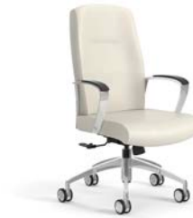
garvey back style executive swivel tilt aluminum loop arm w/PU pad