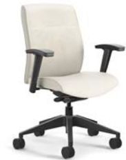
R5 back style management swivel tilt adjustable T arm