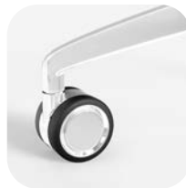
grey urethane soft wheel