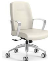
garvey model synchro // swivel tilt