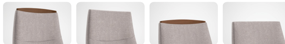
executive, wood crown executive, upholstered management, wood crown management, upholstered