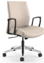
management swivel tilt loop arm model PT5600L