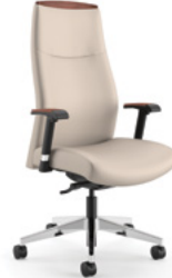
executive synchro wood cap T arm, wood crown model PT5665T