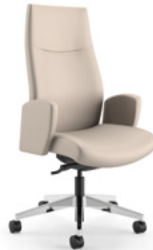
executive synchro upholstered arm model PT5615U