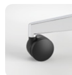
black nylon hard wheel